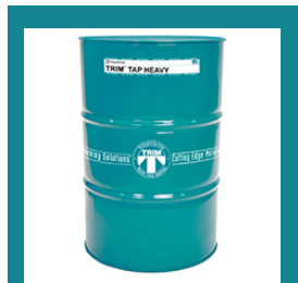
54-gallon drum SKU: TAPHVY-54G UPC-12: 641238009047