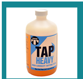
1-pint bottle SKU: TAPHVY-1P UPC-12: 641238009078